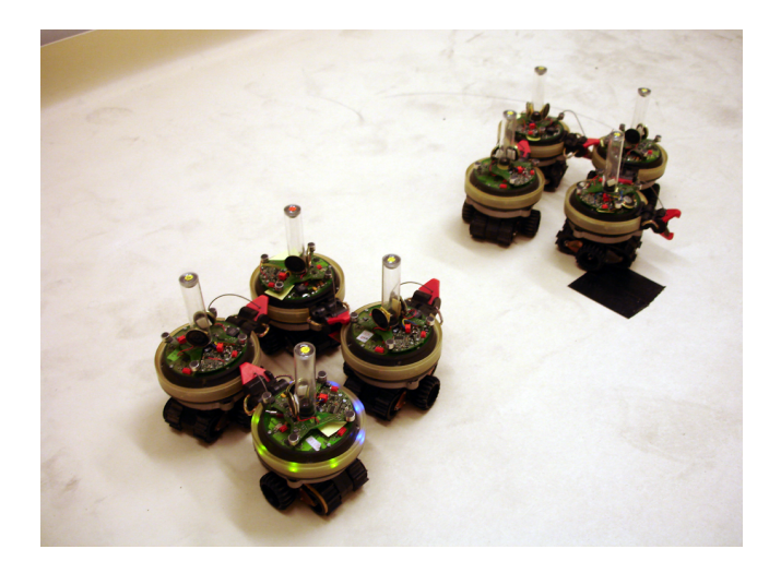
Fig. 2. Two mini-squares: the result of running Script 1 on eight real s-bots.

ing robot sees that another robot is inviting a connection, it ceases to random walk and tries to physically connect to the inviting robot. When a successful connection has been formed, communication is initiated. In the example shown in Script 1, only rule IDs are communicated, however, whole SWARMORPH-scripts can be communicated and subsequently executed by the receiving robot.