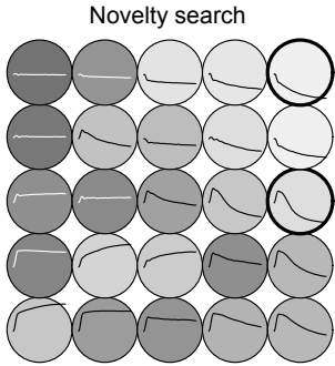
Fig. 1. Kohonen maps representing the explored behaviour space in fitness evolution (left) and in novelty search (right). Each circle is a neuron that is characterised by the vector depicted by the line inside (the average distance to the centre of mass over time). Each behaviour vector is mapped to the most similar neuron. The darker the background of a neuron is, the more behaviours were mapped to it. The neurons corresponding to the best behaviours have a bold circle.