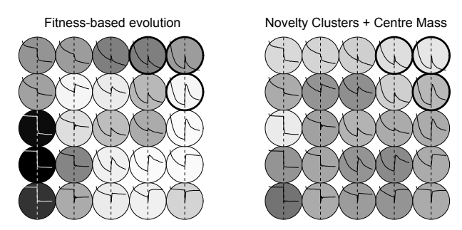
Fig. 4. The explored behaviour space in novelty search with the combined novelty measure and in the fitness-based evolution. In each neuron, the left half is the number of clusters measure and the right half is the centre of mass. The darker the neuron background is, the more behaviours were mapped to it. Neurons with the best behaviours have a bold circle.

some cases they are the ones that the fitness-based evolution could not evolve at all (behaviours that used the wall). In other cases, they were apparently the same solutions that the fitness-based evolution would find in later generations with more complex networks. Due to the incremental nature of NEAT, more complex networks take more generations to evolve. If fitness starts to converge to more complex structures, it takes more time to evolve effective controllers.